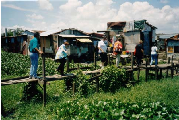
Field visit to Malabon City, Manila