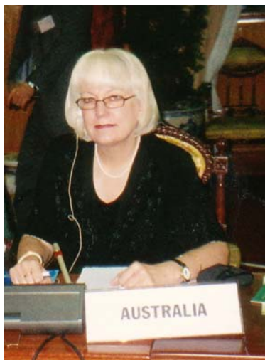
Hon Dr Meredith Burgmann MLC, President of NSW Legislative Council at the 19 th APDA meeting

on water, food security, public health and population. Speakers noted that a number of international conventions have explicitly recognised access to water as a basic human right. Through ratification of these conventions and international instruments, governments have committed themselves to ensure availability of a minimum amount of